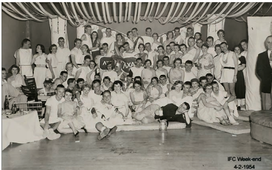
Photo Flashback to 1954 LXA PSU

'50s brothers: get ready for a blast from the past. Check out this shot; doesn't this 1954 Penn State Lambda Chi hangout look nifty? Here's some 1954 trivia that'll take you right back: